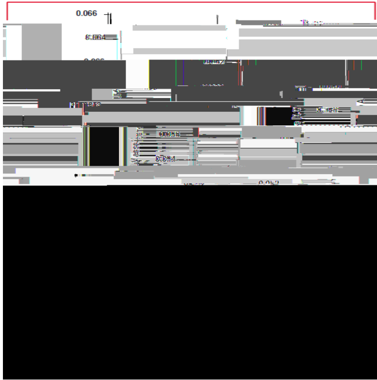
3 TSKgel DN.63